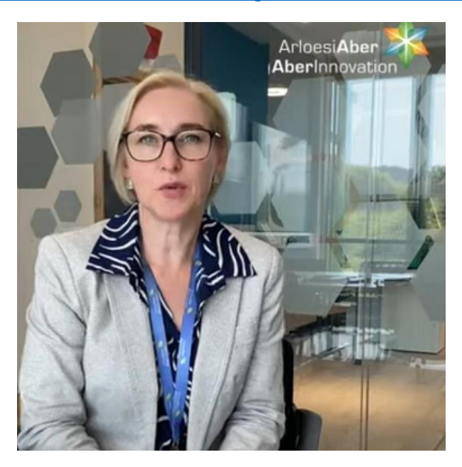
2 - <a href="https://youtube.com/shorts/Am79AgB9kb8?feature=shared">https://youtube.com/shorts/Am79AgB9kb8?feature=shared</a>

Check it out: <a href="https://youtube.com/shorts/Am79AgB9kb8?feature=shared">https://youtube.com/shorts/Am79AgB9kb8?feature=shared</a>