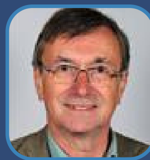
Councillor David Selby Cabinet Member for a More Prosperous Powys Powys County Council