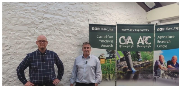
and specifically electricity on farms and rural communities in Wales.

For further details about the WSRID Challenge Fund and the successful projects, visit https://www.growingmid.wales/WSRID .