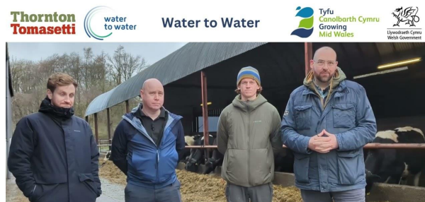
Net Zero Energy independent users for their heating, transport, fuel and electricity.