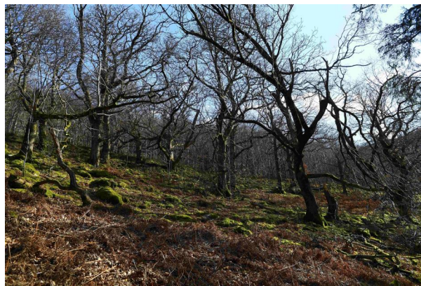
1 - Celtic Rainforest

The UK and Welsh governments have confirmed the release of £11.8m of funding for Mid Wales as part of an investment package aimed at boosting the regional economy.