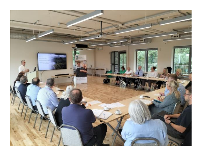
1 - Digital skills & barriers being discussed at our Digital Business Cluster Group.