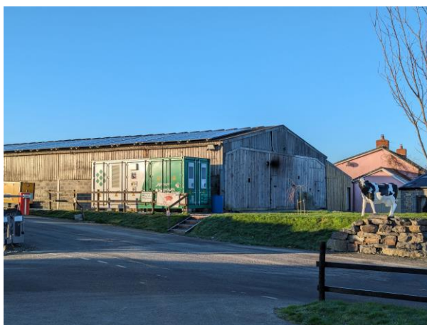
5 - Battery storage at Bargoed Farm