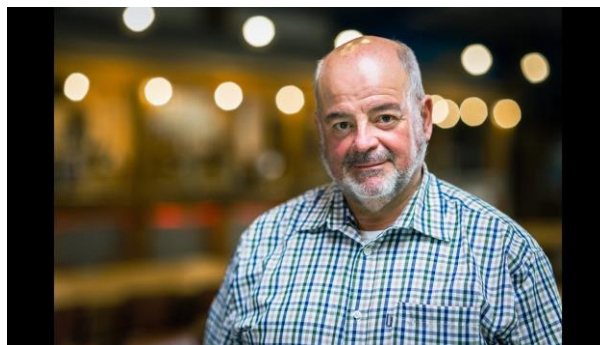
4 - See how the Development Bank supported Bargoed Farm on its journey to becoming a successful, sustainable company.