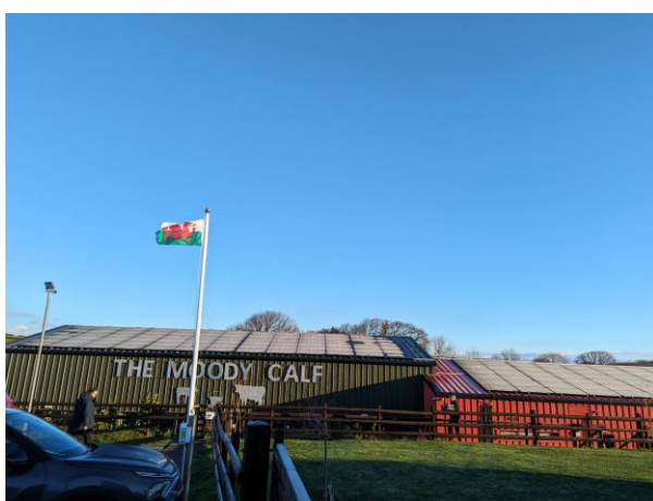
6 - Solar panels at Bargoed Farm