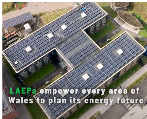
1 - Local Area Energy Planning in Wales

Welsh Government have committed to a major programme of LAEP roll-out, so that every part of Wales will have a plan. Watch the following video by Welsh Government that explains LAEP in Wales (Click on the image below to be directed to a YouTube video): https://youtu.be/vBBiY2sqesc