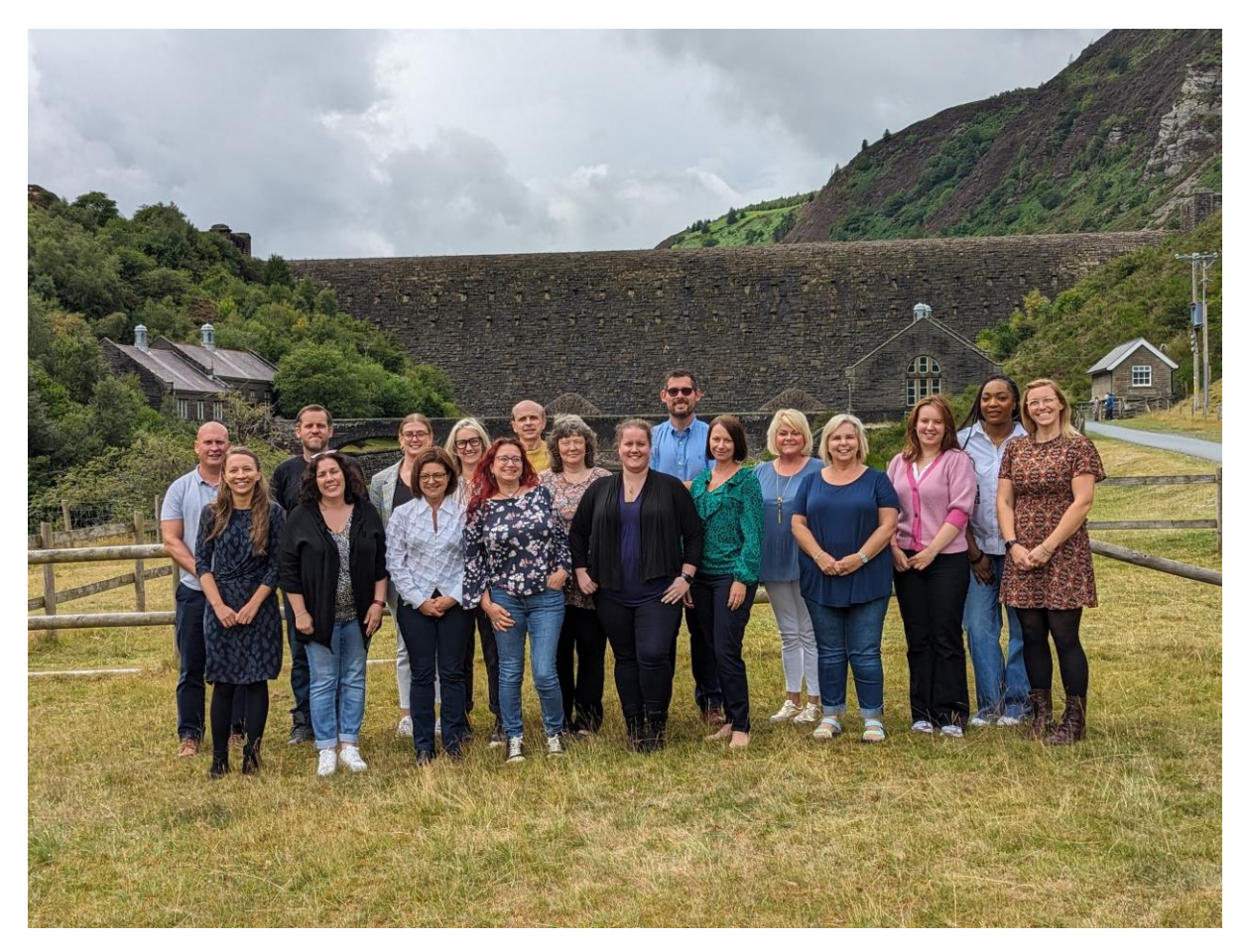
1 - Team Growing Mid Wales