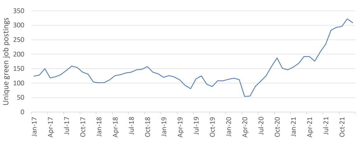
Figure 2 - Number of unique green job postings, by month, Wales, January 2017 – December 2021

There were 1,095 unique green job postings in Wales between January 2021 and December 2021, representing 0.4% of all job postings (273,406). Figure 2Figure 2 shows the active unique job postings per month between January 2017 and December 2021.